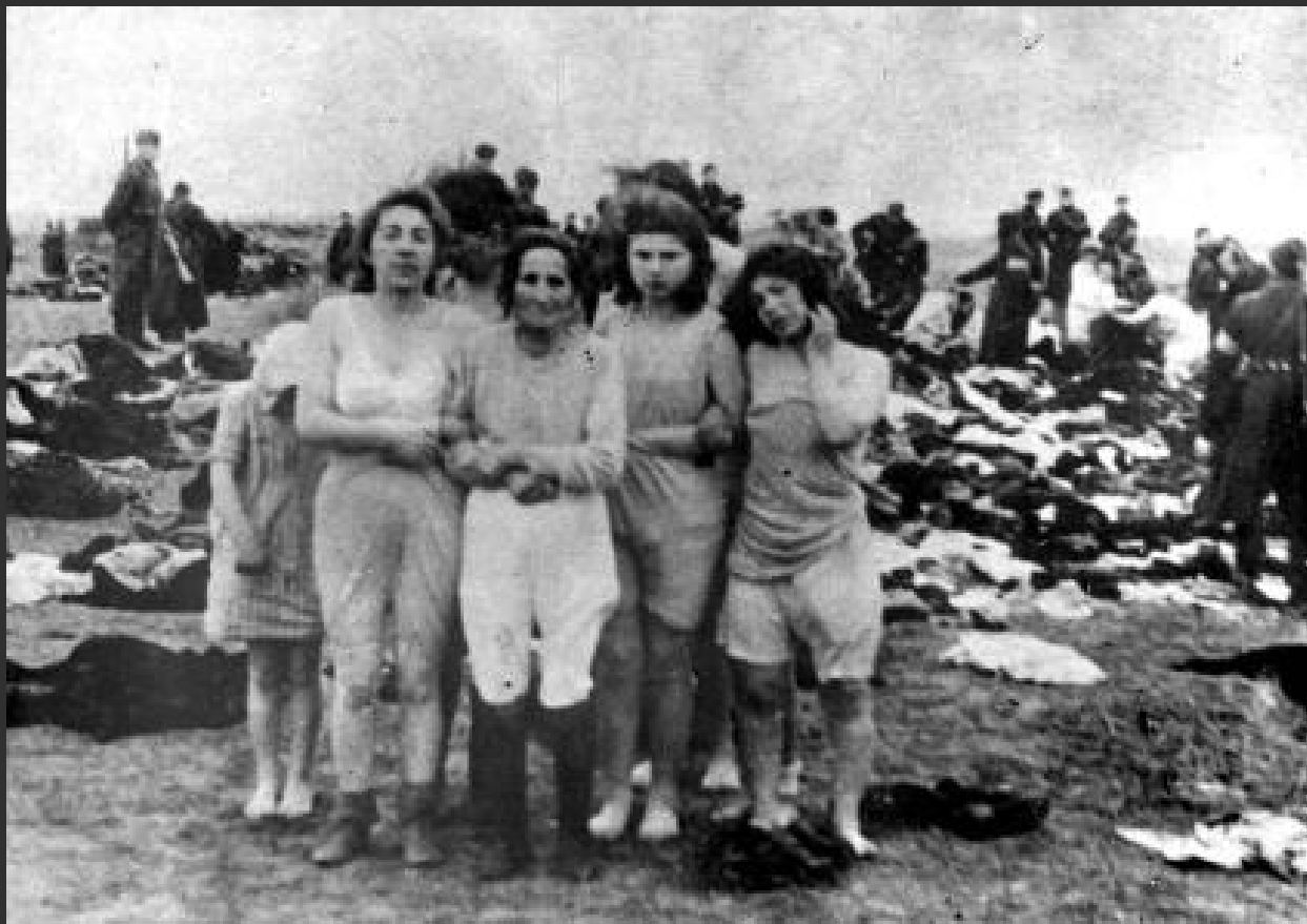
Jewish women before their execution on Šķēde Beach, near Liepāja, Latvia, 1942.

Of the 7,000 Jews living in the Liepāja, Latvia ghetto, just 800 were left alive after the Nazis carried out mass shootings in 1941 and 1942.