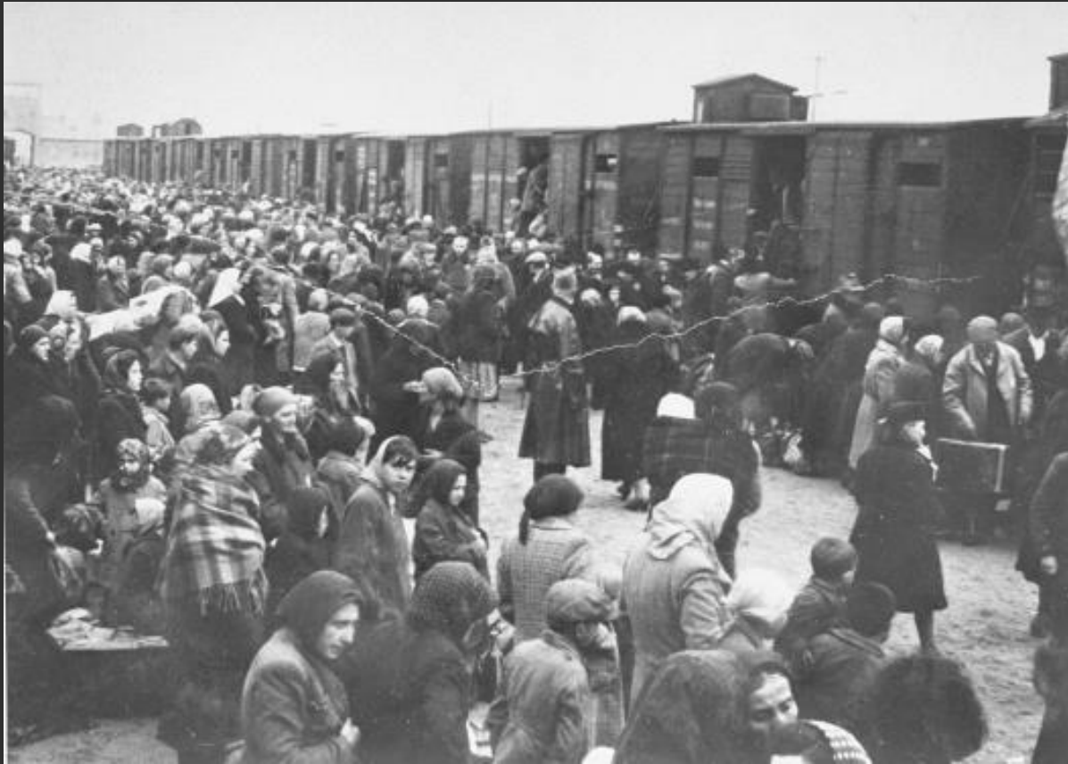
Jewish prisoners await selection on the ramp at Auschwitz-Birkenau.

In a span of 56 days (May 15-July 9, 1944), more than 434,000 Hungarian Jews were crowded onto 147 trains and sent to Auschwitz-Birkenau.