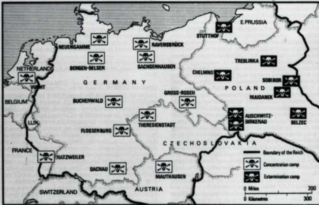
Sites of Nazi concentration camps.

approximately 2,700,000 of 6,000,000 Jews that were killed during the Holocaust were murdered in Nazi extermination camps.