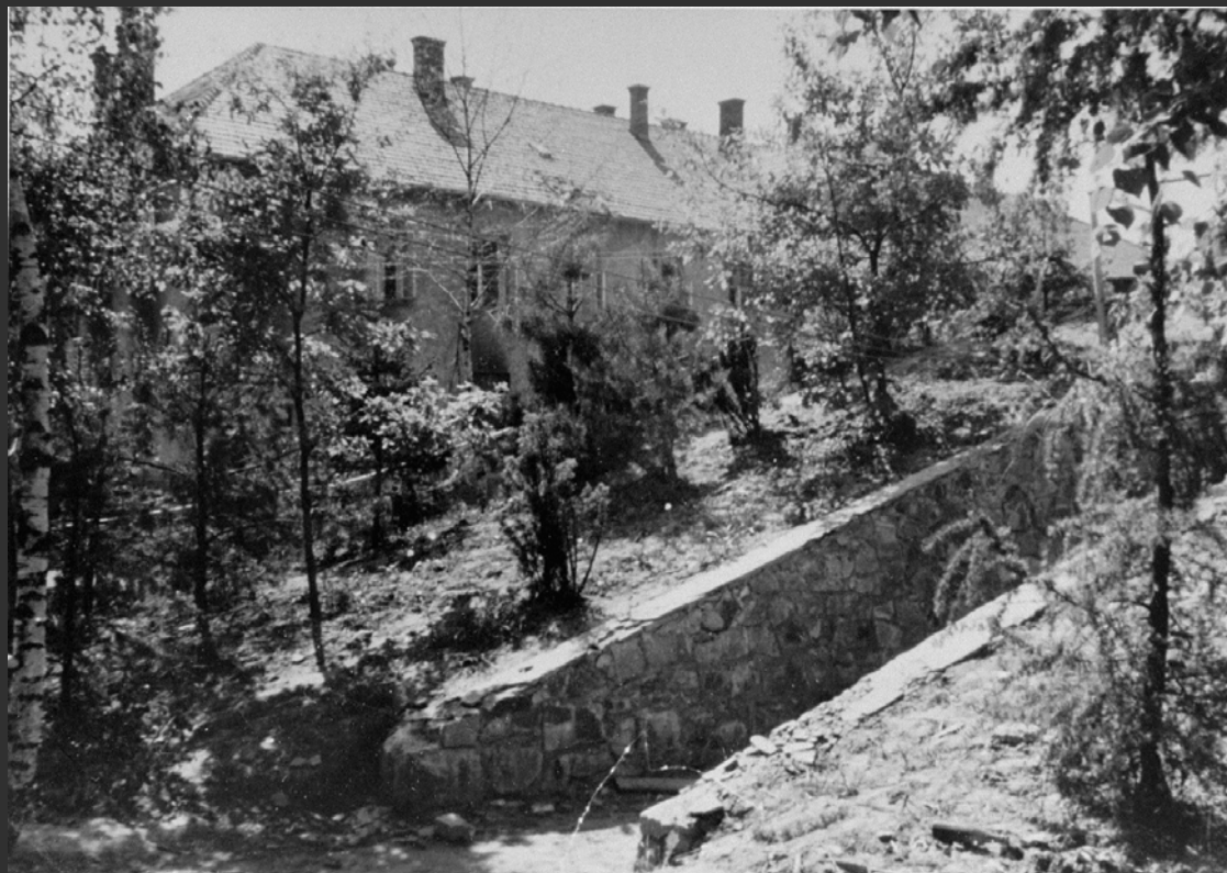
View of the walled entrance to the gas chamber in the main camp of Auschwitz I.