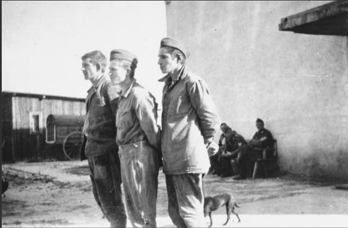
Three Soviet POWs who were captured near Wisznice, Poland stand with their hands tied behind their backs. They were later executed.

At least 3,300,000 Soviet POWs died in Nazi captivity between 1941-1945, mostly as a result of starvation and execution.