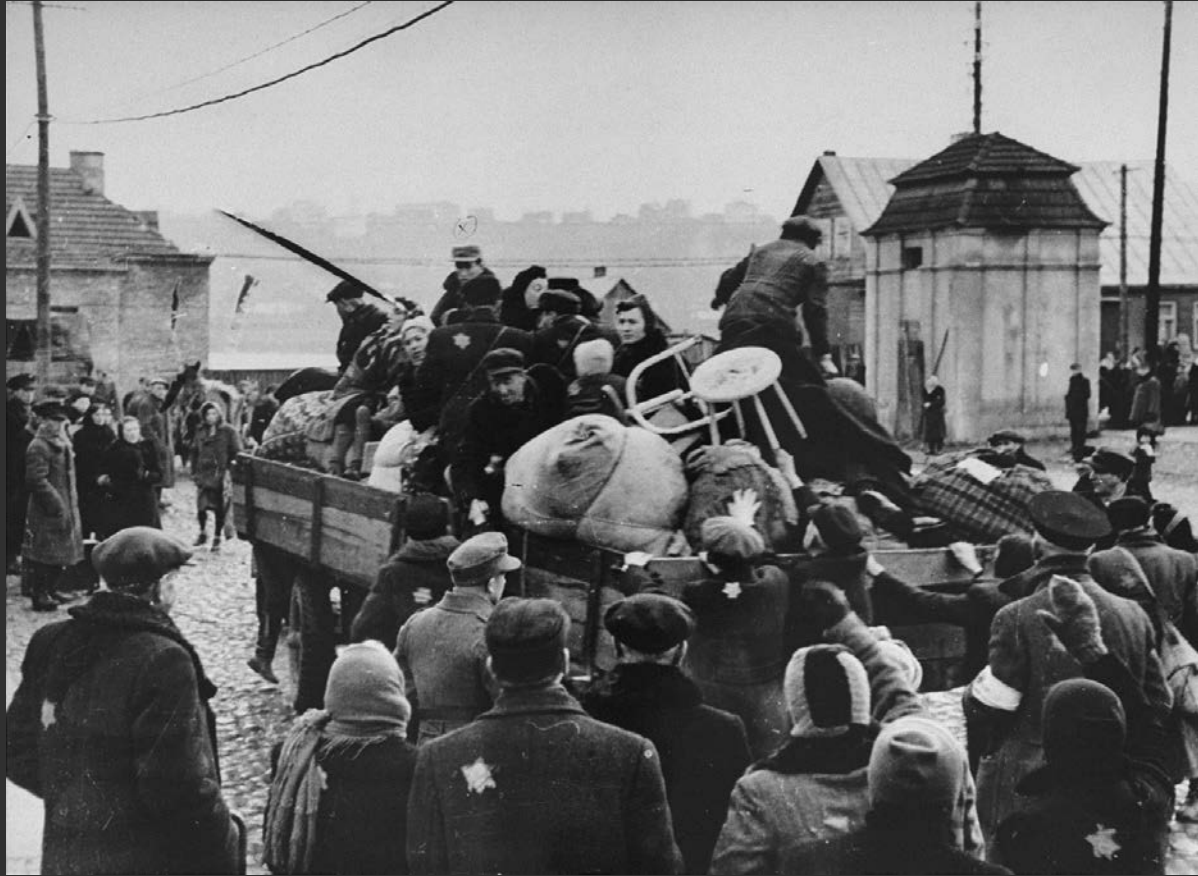
Jews in the Kovno (Kaunas) ghetto in Lithuania are boarded onto trucks during a deportation action to a forced labor camp. Photo credit: USHMM #81079.

Dozens of ghettos and concentration camps were established in the Baltic countries of Estonia, Latvia, and Lithuania. Kaiserwald concentration camp, near Riga, Latvia, had as many as 17 subcamps alone.