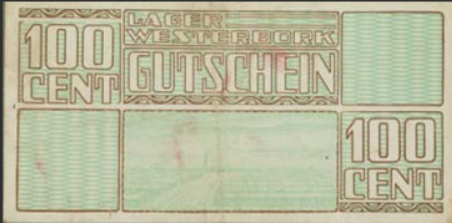
Westerbork transit camp voucher worth 100 cents.

In several camps, prisoners received vouchers to buy supplies. Vouchers were only valid within the camp grounds in order to help stop the possibility of bribery with SS guards.