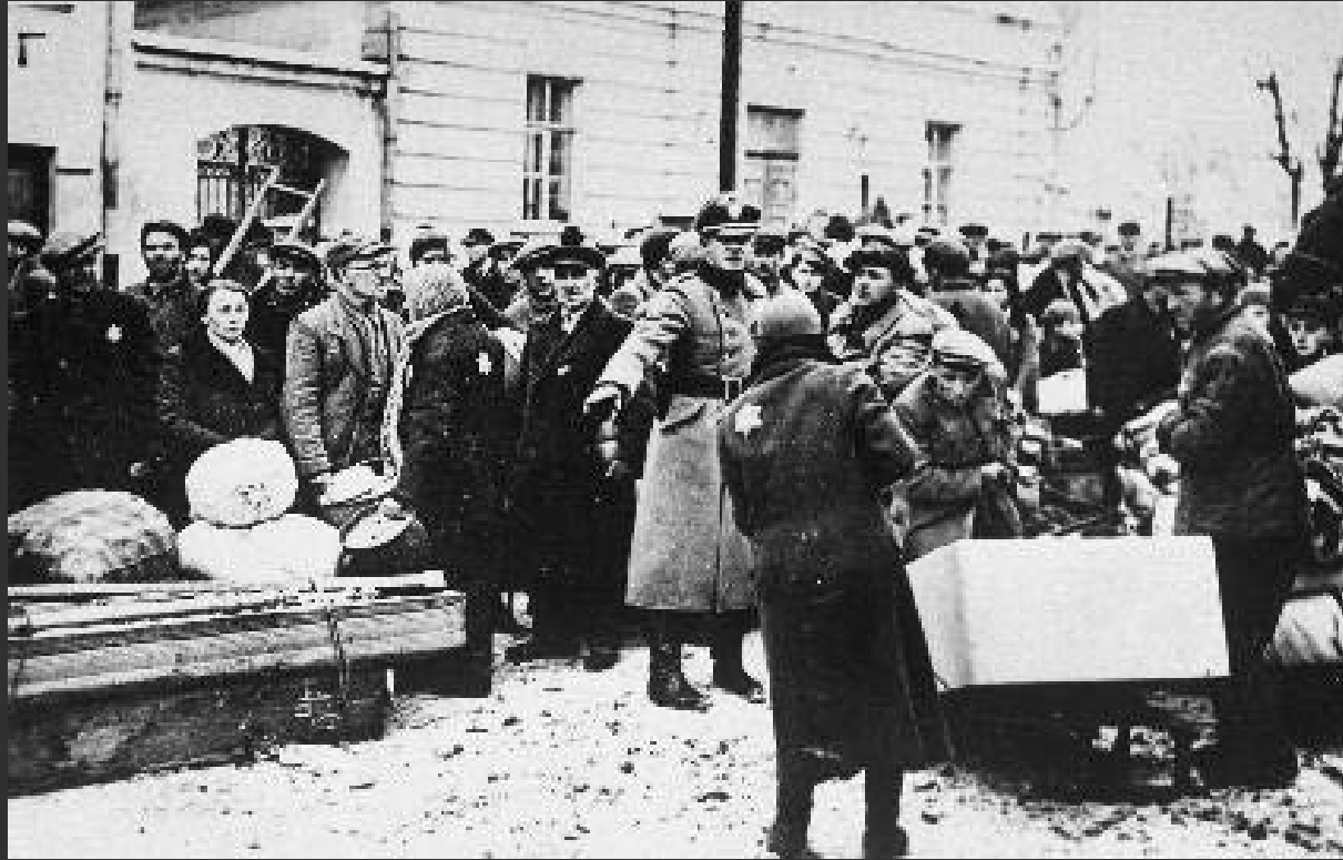
Jews move their belongings into the Grodno, Belarus ghetto.

In November 1941, approximately 25,000 Jews were forced into two ghettos in Grodno, Belarus.