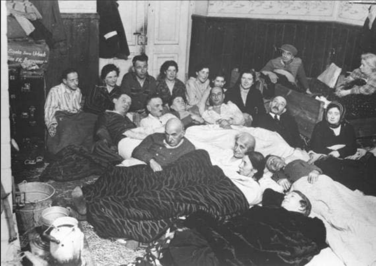
Jewish men and women from Vienna in crowded barracks in the Opole Lubelskie, Poland ghetto. Photo credit: USHMM #45838.

The United States Holocaust Memorial Museum (USHMM) has catalogued approximately 42,500 Nazi ghettos and camps throughout Nazi-occupied Europe.