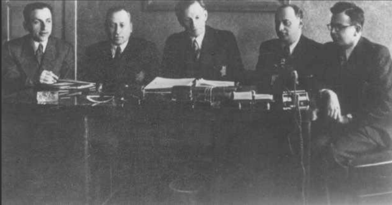
A meeting of the Kovno (Kaunas), Lithuania Judenrat, 1943.

Jewish Councils, or “Judenrat,” were formed by the Nazis and were charged with administering and managing daily life in major ghettos.