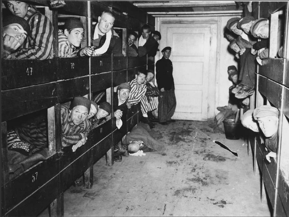
Prisoners look out from their bunks inside a barracks in the Dachau concentration camp near Munich, Germany. Photo credit: USHMM #75034.

At Dachau and at most other concentration camps, typhus, a contagious and deadly bacterial infection, was ubiquitous.